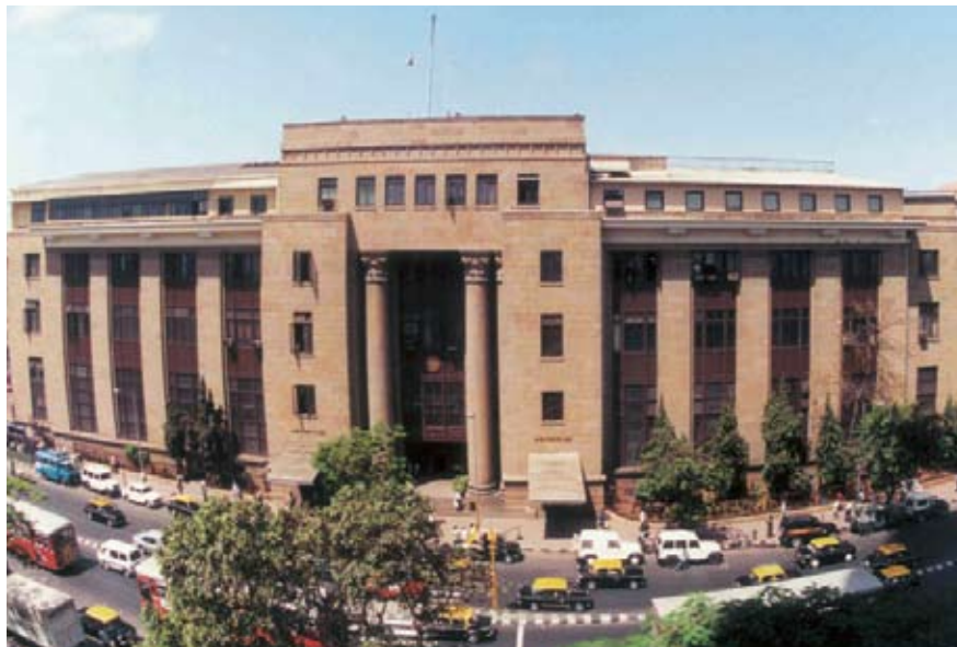
ECONOMIC DRIVER : The RBI wants banks to opt for the SHG model to lend to millions of small and micro units

MFIs first emerged in the late 1990s to raise social and commercial funds for lending to the underprivileged. Today there are over a thousand Indian MFIs, most of which service the rural poor. Several