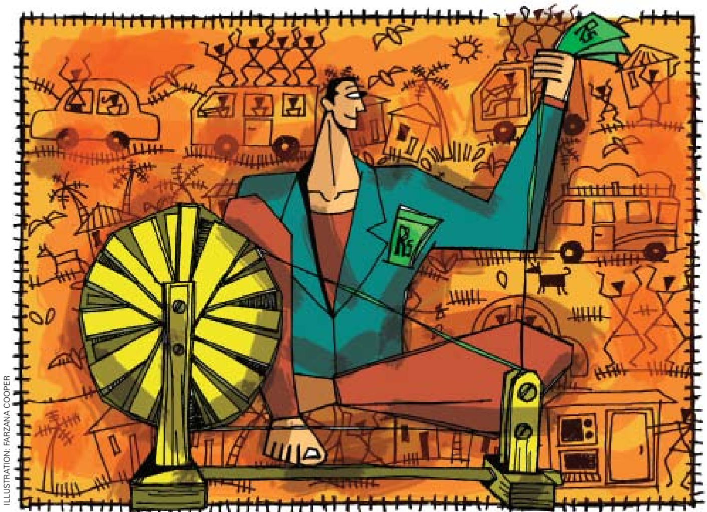
ILLUSTRATION: FARZANA COOPER

India is one of the most promising markets for microfinance in the world. Banks and microfinance institutions, says Rajeshwari Adappa Thakur , are unveiling plans to meet the enormous demand for credit from the huge untapped market, both in urban and rural areas.