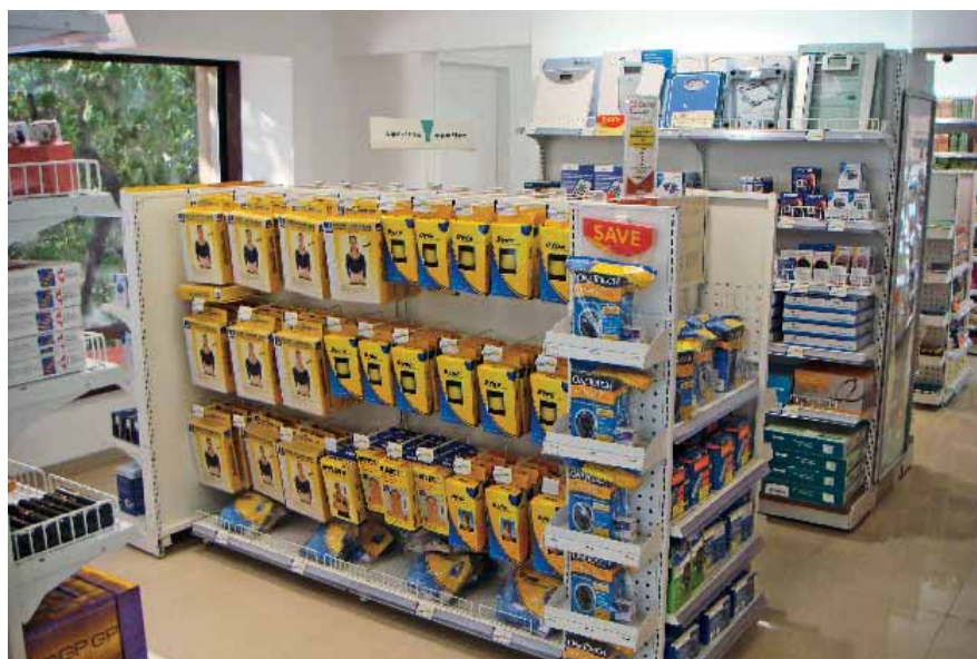
HUGE OPPORTUNITIES: The retail revolution is changing the way Indians go about their healthcare spends