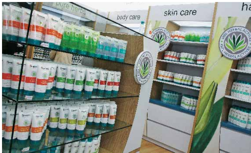
EXPANSION SPREE: The pharma retailing sector could see investments of about $150 million over the next couple of years